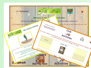
The Club Activities Section