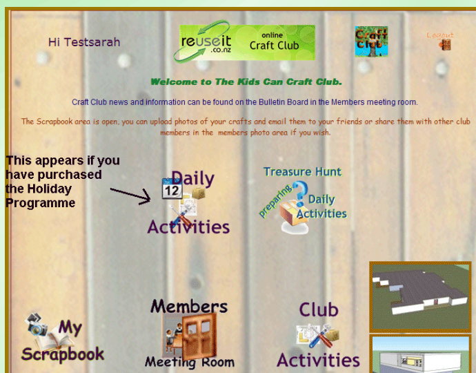
The Main Club Page

There are a number of challenges available for our members to join in with and show their creativity.